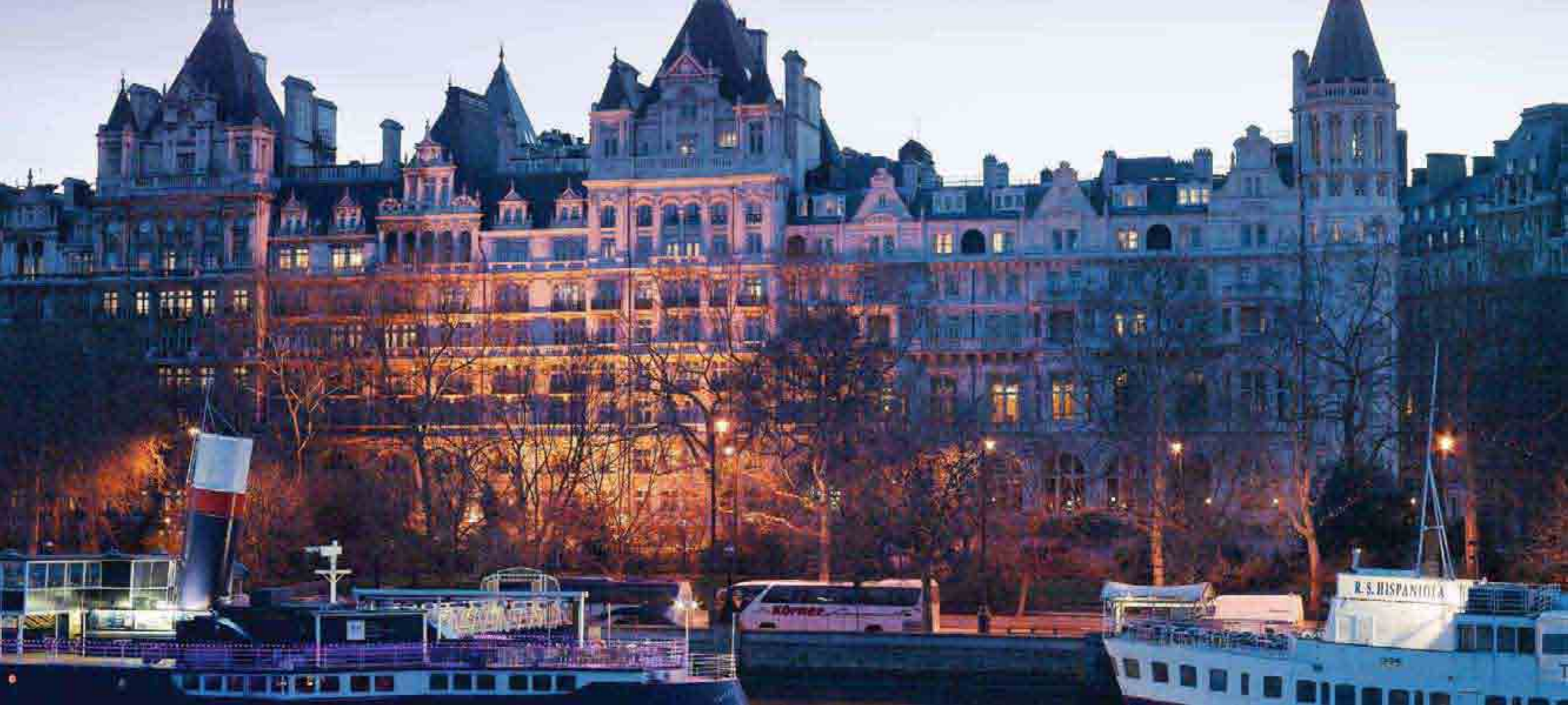
THE ROYAL HORSEGUARDS